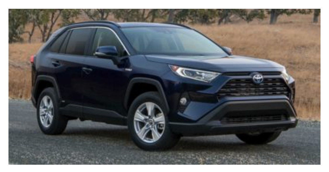
Note:Photo may not represent exact vehicle or selected equipment.

This document contains information considered Confidential between GM and its Clients uniquely. The information provided is not intended for public disclosure. Prices, specifications, and availability are subject to change without notice, and do not include certain fees, taxes and charges that may be required by law or vary by manufacturer or region. Performance figures are guidelines only, and actual performance may vary. Photos may not represent actual vehicles or exact configurations. Content based on report preparer's input is subject to the accuracy of the input provided.